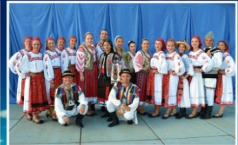
Balada - Edmonton, Alberta