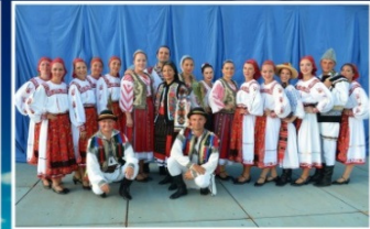
Balada - Edmonton, Alberta